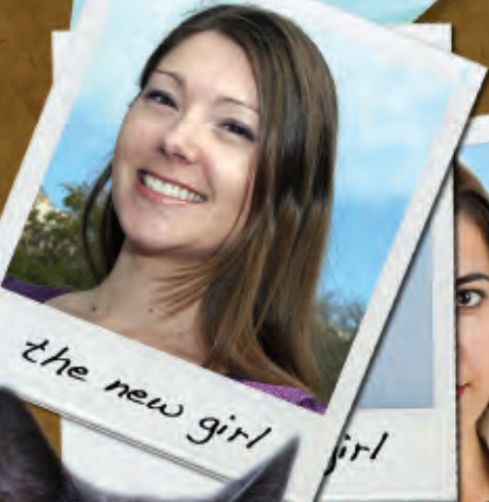
the new girl