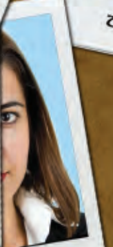
the other other girl